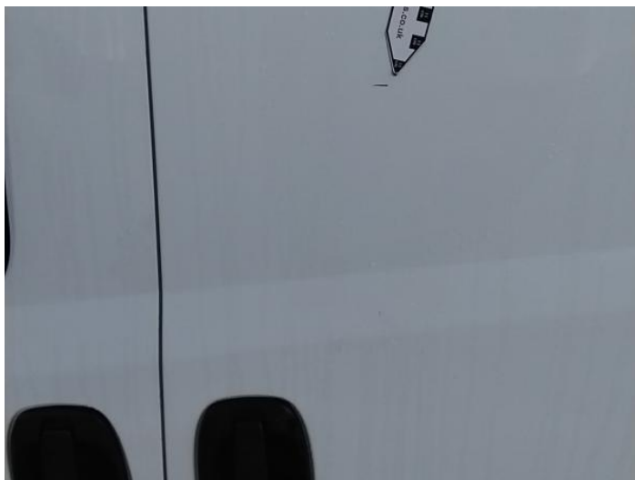
1: Door nsr Chipped 1 To 5