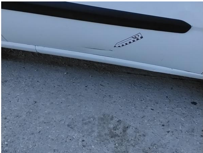
3: Sill os Scratched Over 25mm Thru Paint