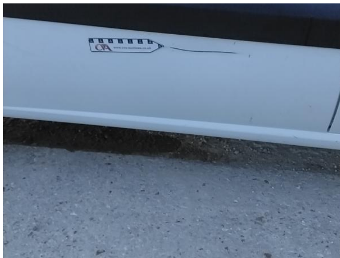
2: Sill os Scratched Over 25mm Thru Paint